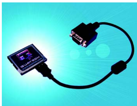
Quatech CompactFlash serial I/O cards add one or two RS-232 or RS-422/485 ports to portable computers.

Quatech CF serial cards provide a simple solution for adding serial ports to handhelds, tablets, PDAs, and other portable computing devices.